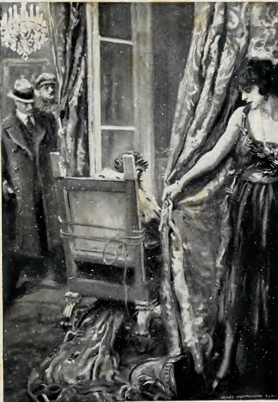
It was like a triumph at the opera.